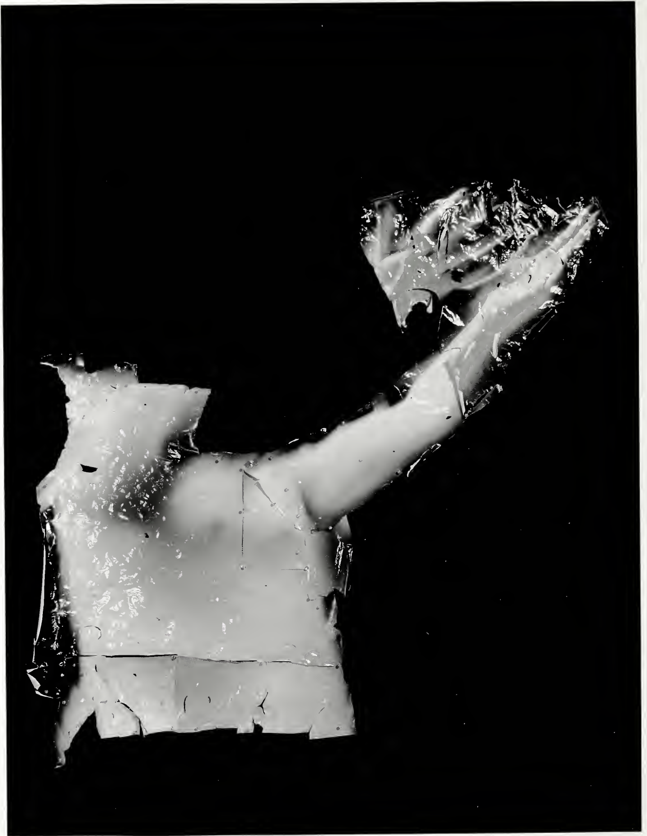
Spaces, Untitled VIII, 1994, silver-print fragments, 64 x 48 1/2 inches