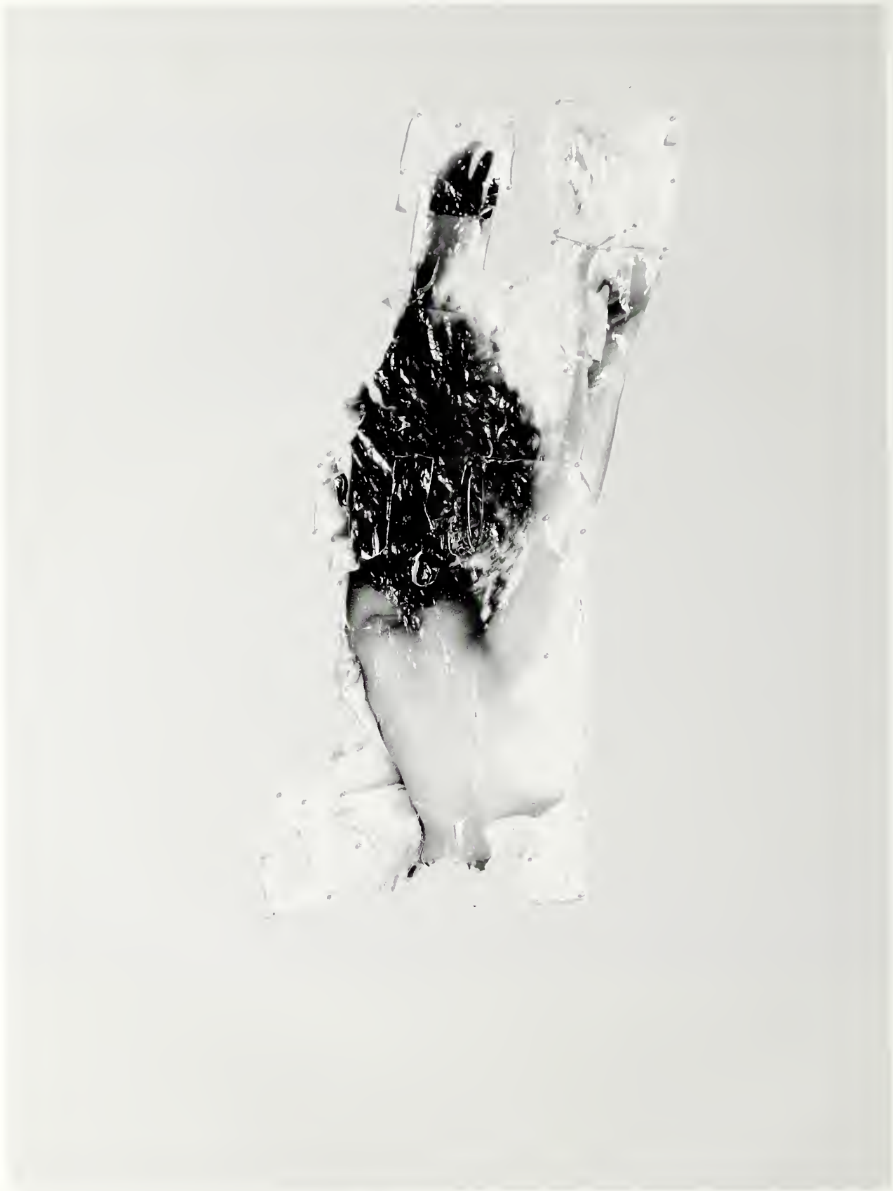
Memories, Untitled XXXI (skinned) , 1993, silver-print fragments, 64 x 48 1/2 inches