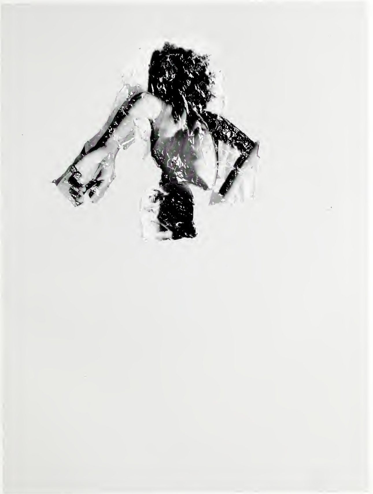
Memories, Untitled XXIX (skinned) , 1993, silver-print fragments, 64 x 48 1/2 inches