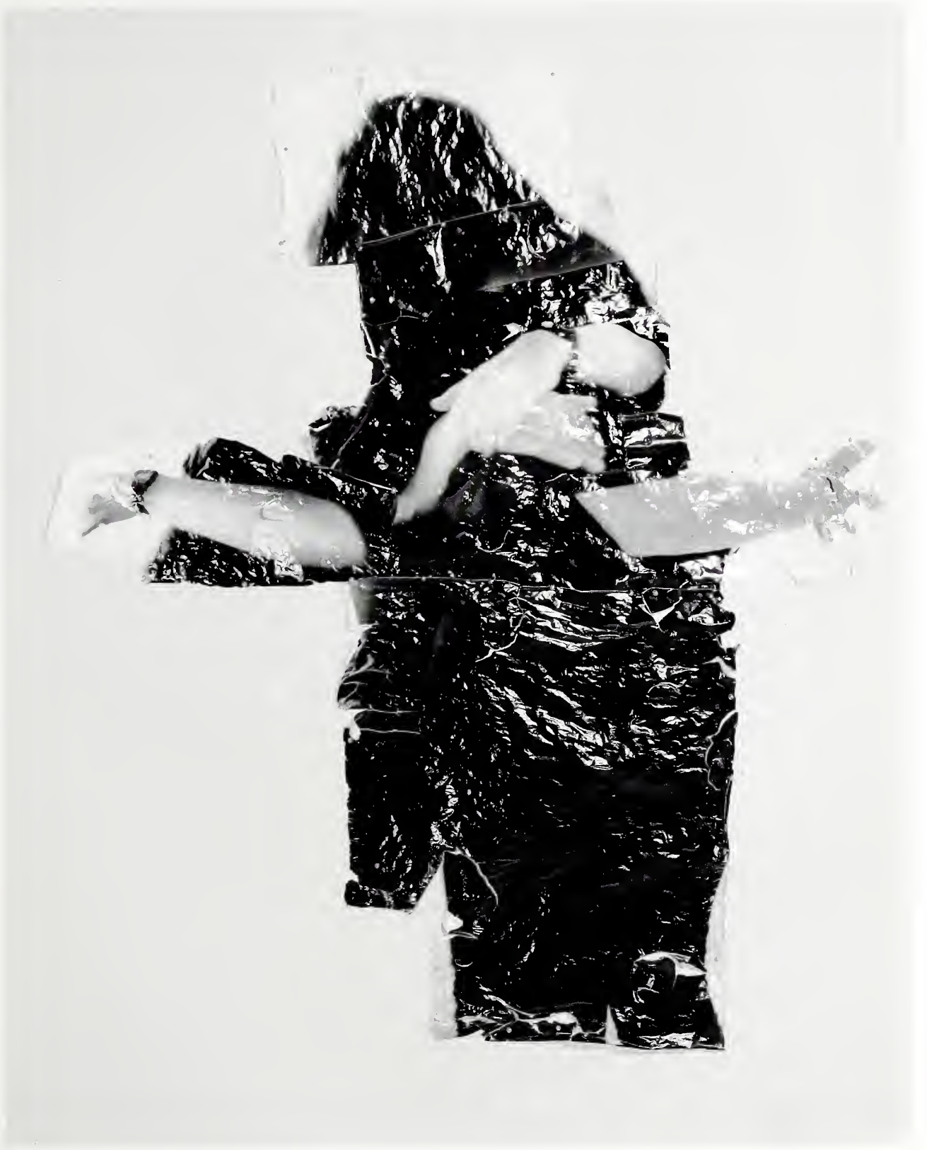
Spaces, Untitled XIII , 1994, silver-print fragments, 64 x 48 1/2 inches