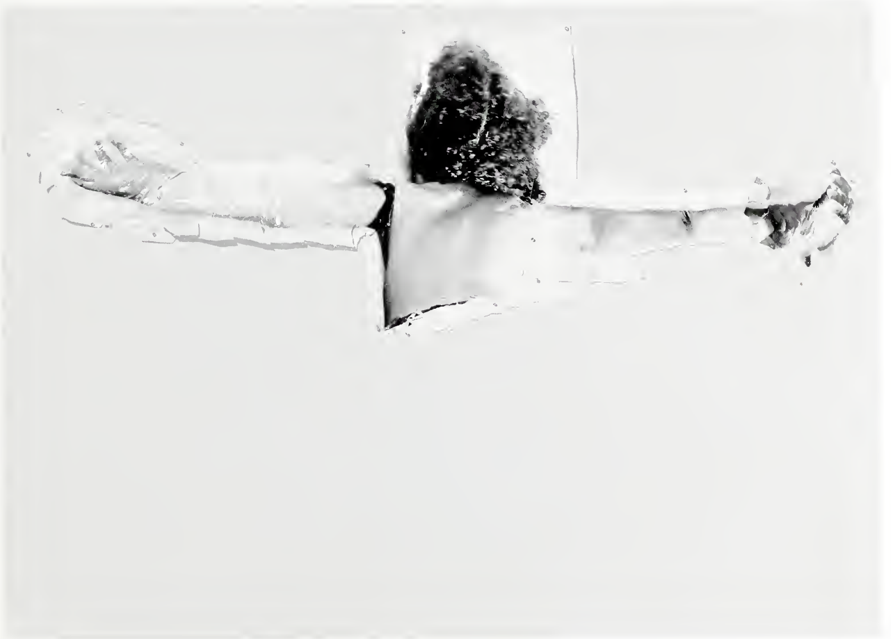
Memories, Untitled XXX (skinned) , 1993, silver-print fragments, 48 1/2 x 64 inches