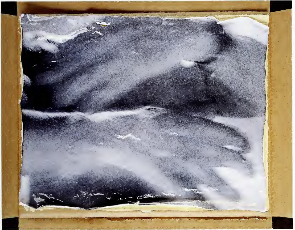
Nature Monochrome VI and VII, 1995 (detail)