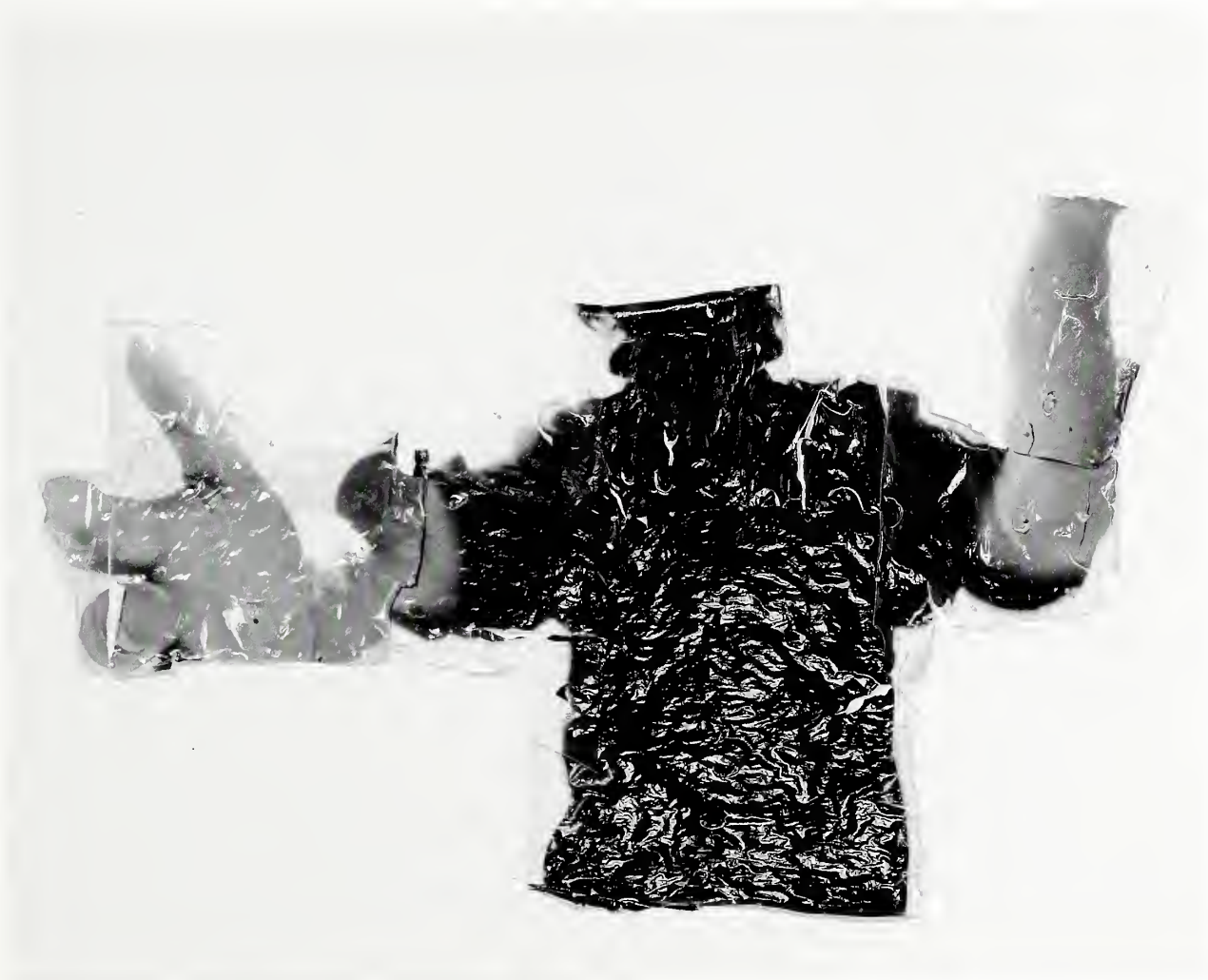
Spaces, Untitled X , 1994, silver-print fragments, 48 1/2 x 64 inches