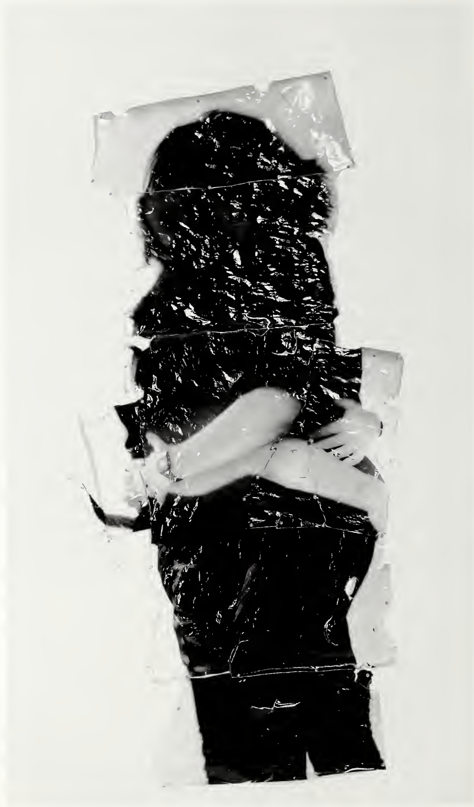
Spaces, Untitled XII, 1994, silver-print fragments, 64 x 48 1/2 inches